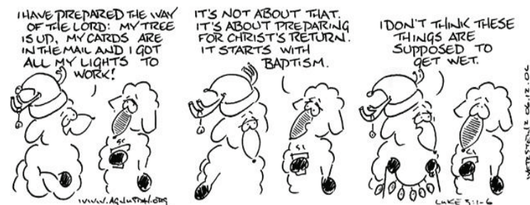
Agnus Day appears with the permission of www.agnusday.org

Excerpt: 2019 Workbook for Lectors, Gospel Readers & Proclaimers of the Word.